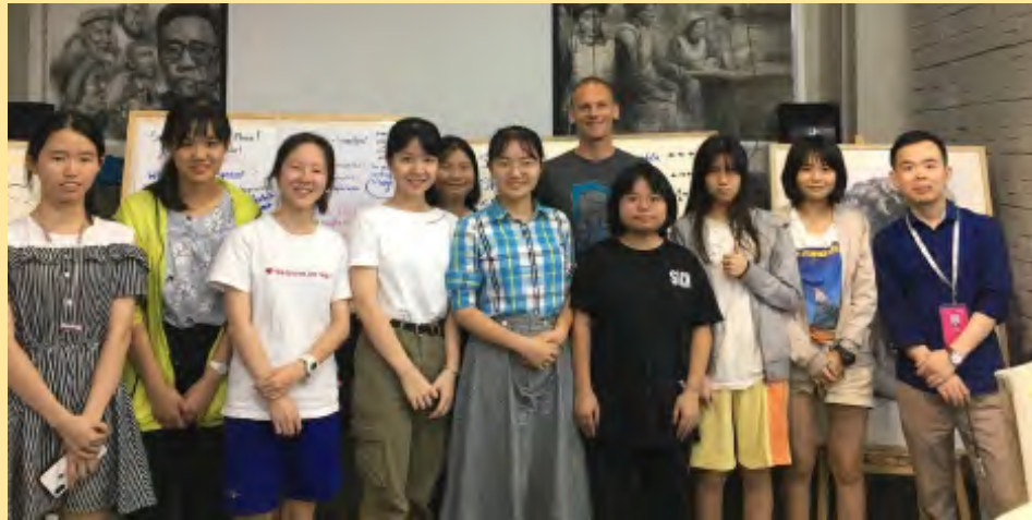
Top: Dinner with an SCL family in Shenzhen. Food: stomach, intestines Bottom: The Shuhua Art Academy in Guangzhou

The biggest “ah-ha” I experienced on my trip to China related to both the population density and the communist system of government. The following question summarizes my thoughts and is a driving factor in my thinking now and likely for the foreseeable future... How does an individual person have a