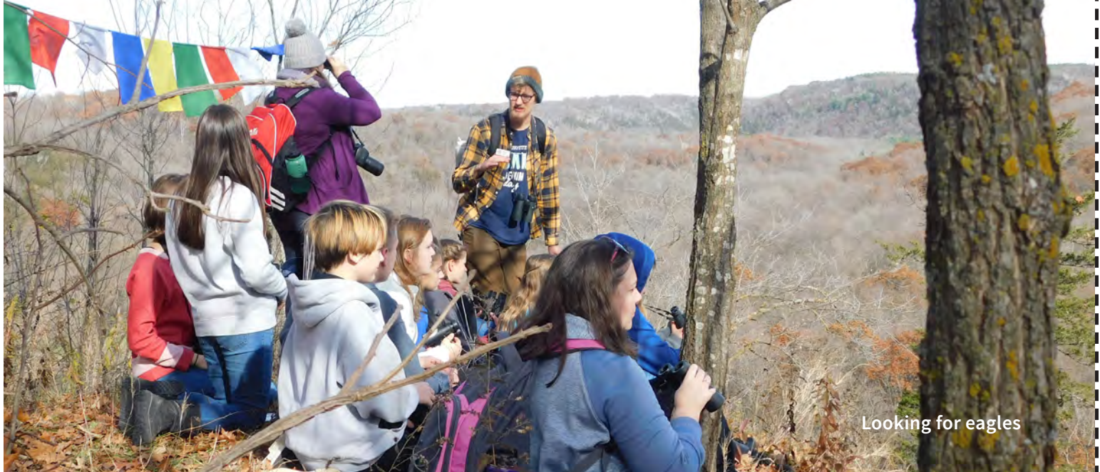
Looking for eagles