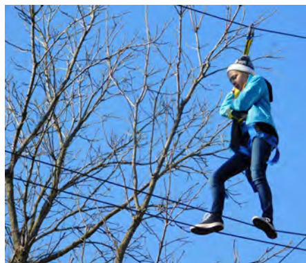
left - “Treetops” high rope course